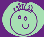
Special Needs & Disabilities