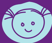
Under 5's Support