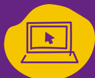
Data & IT