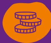
Money & Debt Advice