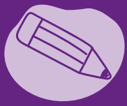
School Uniforms & Clothing