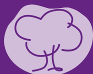
Food & Energy